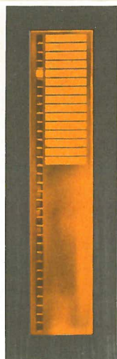
Y-2006 Bronze panel equipped with push-button lights. Press the light button and it lights up.

Contemporary designs used for synagogues... many standard emblems and sizes available.