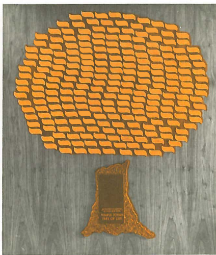
Y-3001 Tree of Life with bronze trunk and bronze anodized leaves on which inscription is engraved. Background illustrated is synagogue wall, or we can mount tree on walnut board.