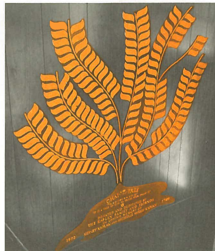
Y-3002 Another Tree of Life design (see Y-3001) which can be mounted on your synagogue wall or on walnut board.